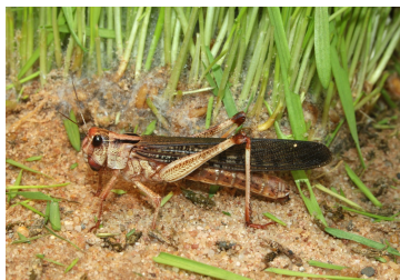
A Yummy Wild Locust

THOUGHT - John's message was the message of a prophet: he dressed and ate as a prophet. The believer is to be disciplined and to live moderately (Lu. 9:23+; Ro. 12:1 + ) The believer's dress and habits should be adapted to meet the needs of his people (POSB) Spurgeon added "'Lord, let not my meat, my drink, or garments, hinder me in thy work!" Is there something trivial and/or external hindering you for following your calling by the Lord, for as Peter said "each one has received a special gift, employ it in serving one another as good stewards of the manifold grace of God. (1 Pe 4:10-11 + cf Eph 2:10 + ).